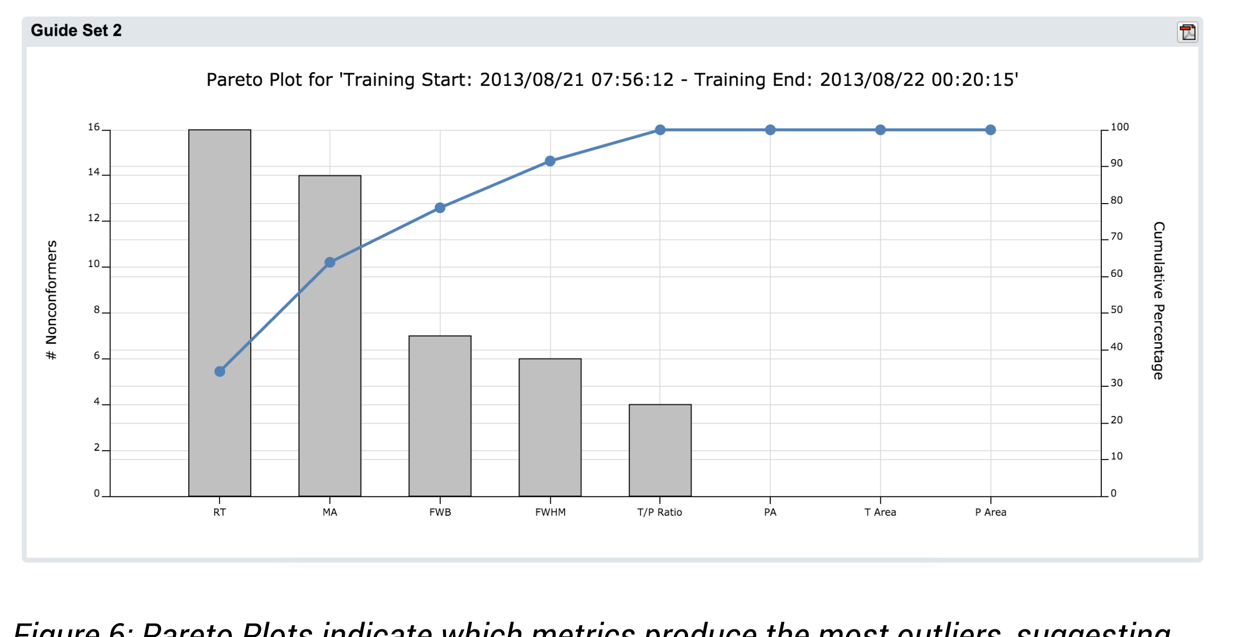
Figure 6: Pareto Plots indicate which metrics produce the most outliers, suggesting potential areas of corrective action in terms of instrument calibration and maintenance. Here, retention time (RT) is the most frequent outlier, followed by peak area (PA), and other metrics. Both small molecule and proteomic data is included.